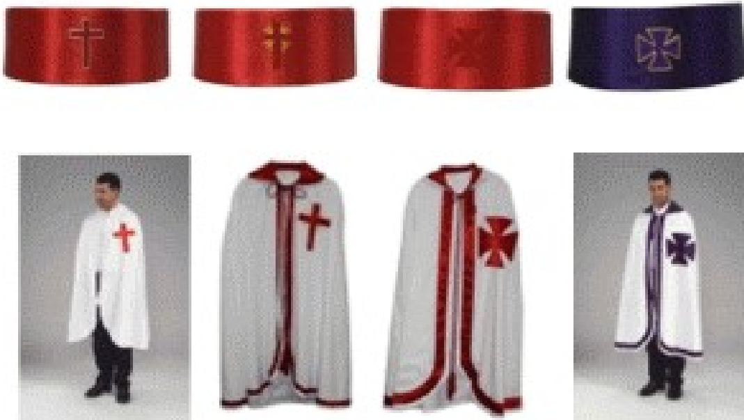
Cap and Mantle Uniforms