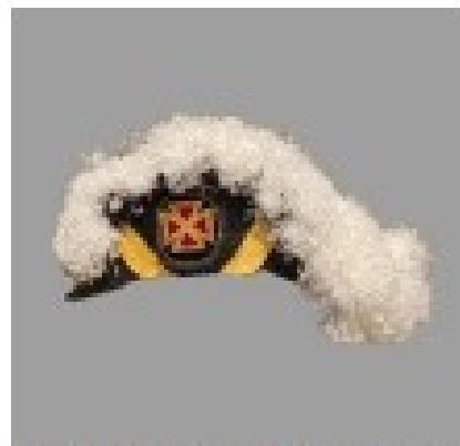
Figure 3 Grand Commandery Officer Chapeau