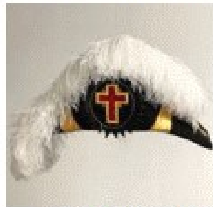
Figure 2 Past Commander Chapeau