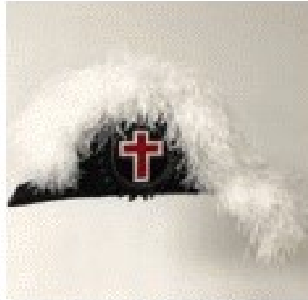
Figure 2, Sir Knight Chapeau