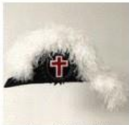
Figure 2, Sir Knight Chapeau