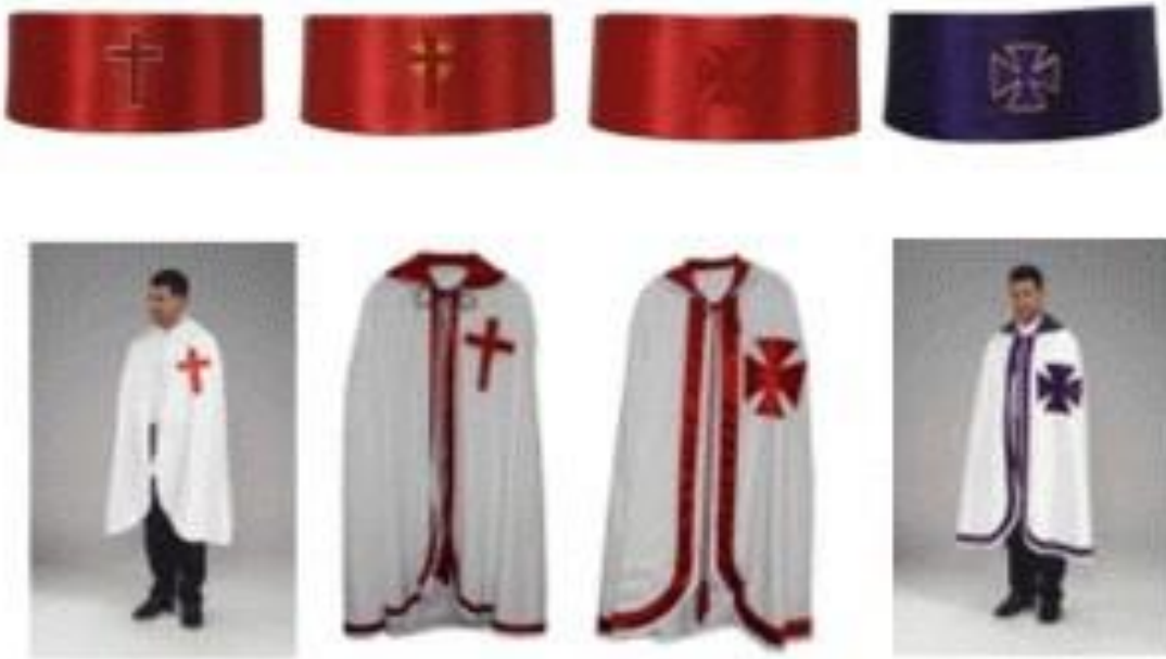
Cap and Mantle Uniforms