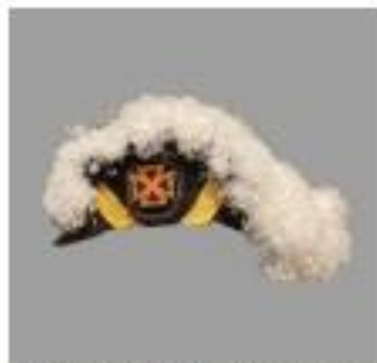
Figure 3 Grand Commandery Officer Chapeau