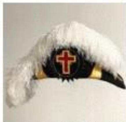
Figure 2 Past Commander Chapeau