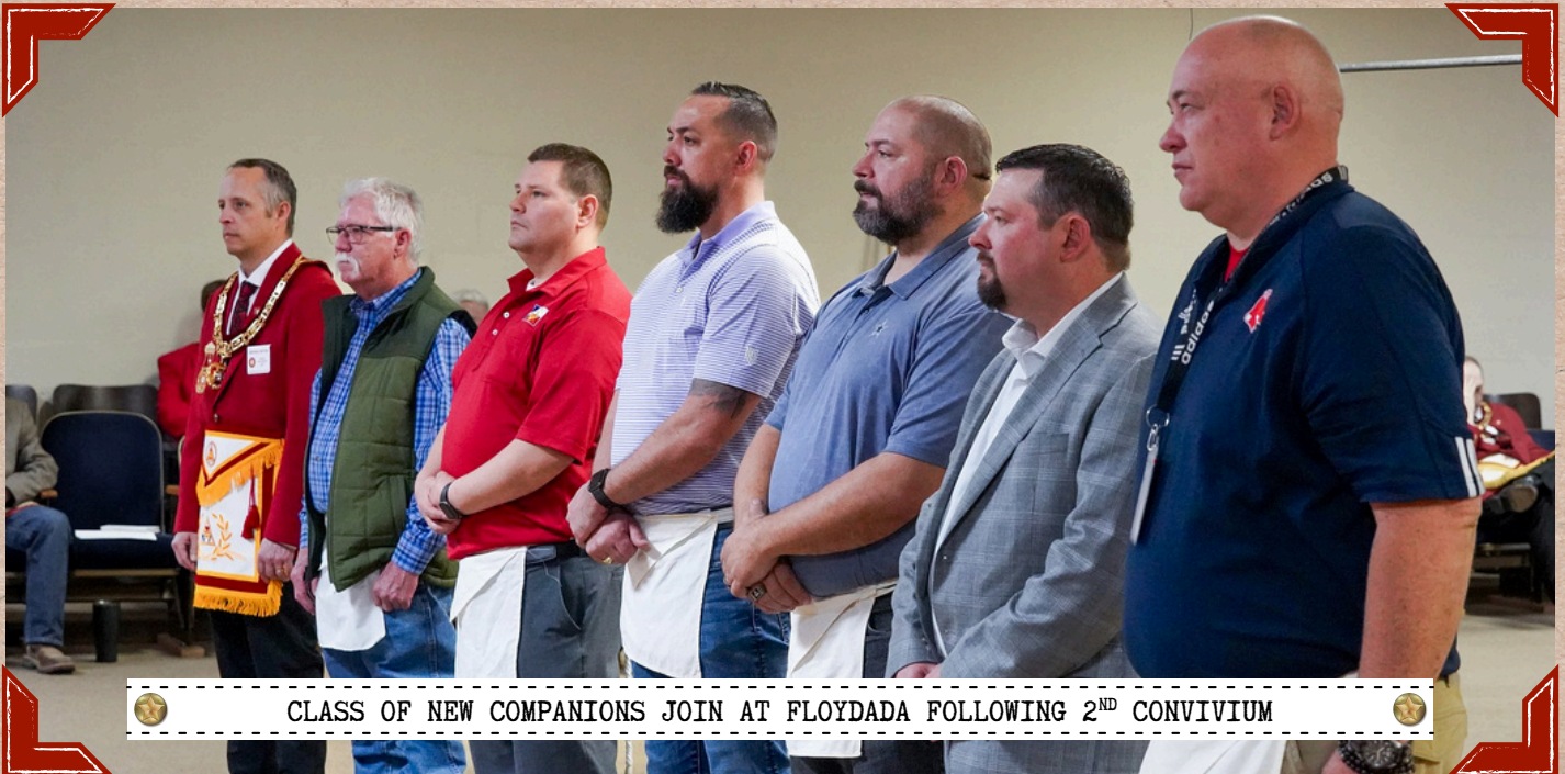
CLASS OF NEW COMPANIONS JOIN AT FLOYDADA FOLLOWING 2 ND CONVIVIUM

WELCOME TO "THROUGH THE VEILS" MONTHLY NEWSLETTER!